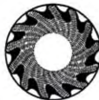
XTL @ 15 psid

Most wound cartridges tend to surface load thus preventing the maximum use of their internal surface area. As a result of a unique design and manufacturing process, the XTL cartridge allows the maximum use of its internal surface area. Shown here are illustrations of typical dirt-loading characteristics of a standard wound cartridge and an XTL cartridge at 15 psi differential.