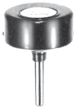
Figure 3 - Model 23-0208XX-000