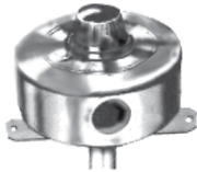
Figure 4 - Model 23-0210XX-000*