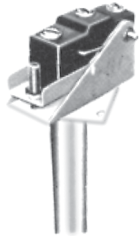
Figure 2 - Model 23-0203XX-000