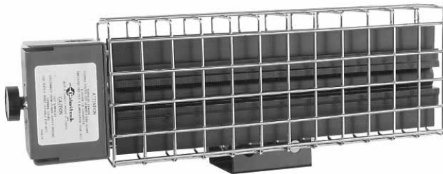
(Guard optional on some units)