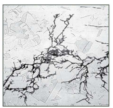
Photograph showing the typical "lightning bolt" cracking pattern associated with SCC.

18-8 austenitic stainless steel is most susceptible to SCC. This includes the 300 series stainless steels and the commonly used 316, 316L, 304 and 304L grades. This suggests that other alloys like the 400 series and 800 series would be more resistant. Grades with lower nickel and higher chrome, duplex stainless steel, have been developed specifically to resist SCC. However, at this juncture, the 300 series stainless steels are the most widely used and as a result are chosen because they are readily available and relatively low cost.