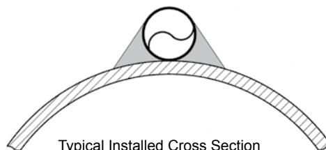
Typical Installed Cross Section (Fillet application)