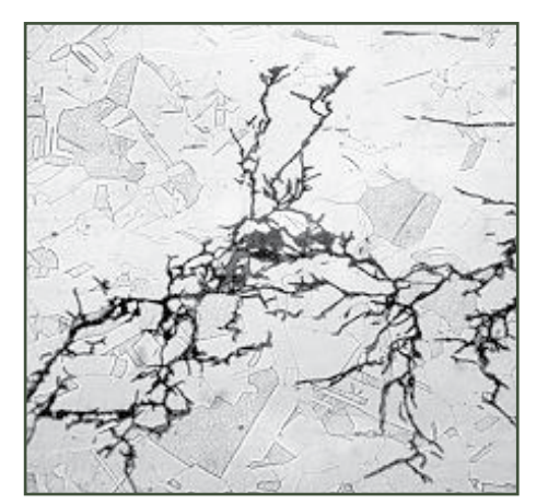
Photograph showing the typical "lightning bolt" cracking pattern associated with SCC.

heat speeds up the corrosion reaction rate.