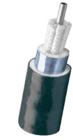
ThermoTube SL-HTX Shown

In addition to the electrical heat tracing and preinsulated and/or heat traced tubing bundles, Thermon also offers and provides the complete line of termination kits, accessories and controls as well as a full plant audit services and turnkey installations.