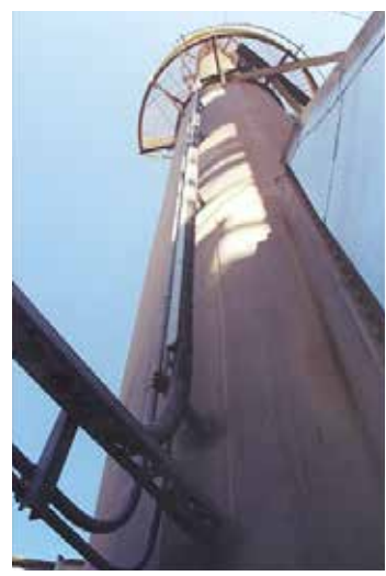
TubeTrace Bundles are ideal for CEMS