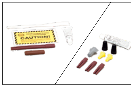
PETK circuit fabrication kit includes a power boot, end cap, RTV adhesive.

SCTK splice connection/termination kit includes a power boot, wirenuts, RTV adhesive.