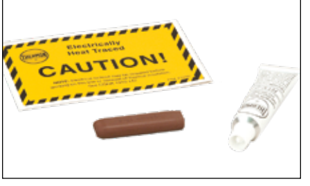
ET-6C, ET-7C, ET-8C end termination kits are designed to properly terminate the end (away from power) of a heat tracing circuit. Each kit includes a rubber end cap, RTV adhesive and caution label.