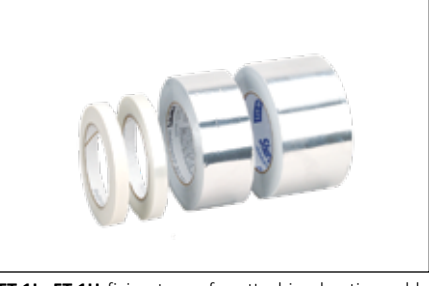
FT-1L, FT-1H fixing tapes for attaching heating cable to piping every 12" (30 cm) or as required by code or specification.

B-21 for pipes up to 21" (530 mm) diameter