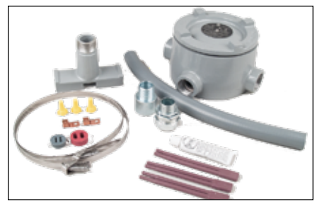
ECT-2 is designed for connecting three heating cables to power or for splicing three cables together.

ECA-1-SR ......BSX, RSX, HTSX, KSX, VSX-HT, USX ECA-1-ZN ......FP, HPT