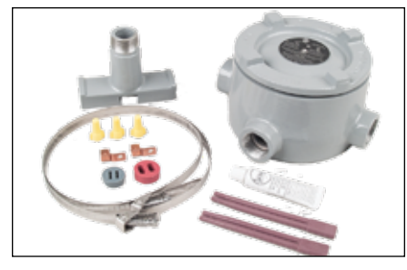
ECA-1 is designed for connecting one or two heating cables to power or for splicing two cables together.

Thermon metallic accessories utilize epoxy-coated aluminum junction boxes and expediters and are approved for ordinary and Division 2 hazardous locations. The kits have a maximum pipe exposure temperature rating of 482°F (250°C) with a minimum installation temperature of -60°F (-51°C).