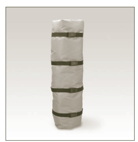
SF Cylinder Blanket is manufactured from silicone coated glass cloth with 1-1/2" fiberglass insulation. The cylinder blanket conserves heat and maximizes heat transfer into the cylinder.