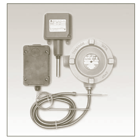
Control Thermostats: Thermon offers a complete line of mechanical thermostats and electronic control and monitoring modules designed and approved specifically for electric heat tracing applications. For complete details, refer to the Controls and Monitoring section of the Electric Heat Tracing catalog or contact Thermon.