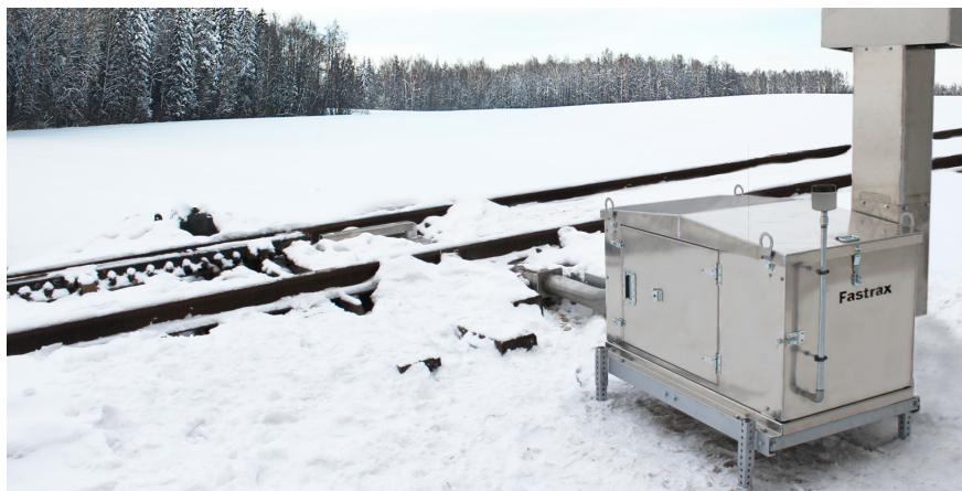
Figure 18 – FEB-204803