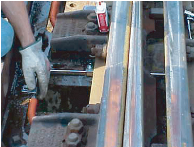
Figure 8 – Movable Point Frog Retrofit

Note: Custom lengths and wattages available.