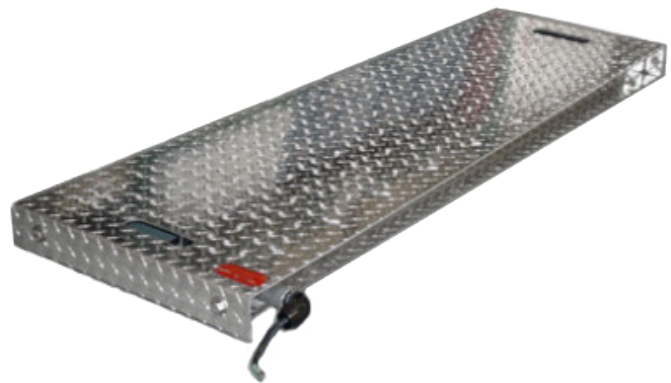
Table 10 – Platform Heater Selection Guide