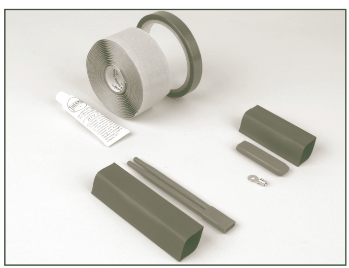
FHT1-R-10 ... contains components to fabricate 10 power connections and 10 end terminations for RSX foundation heating cable. (Components for a single circuit shown.)