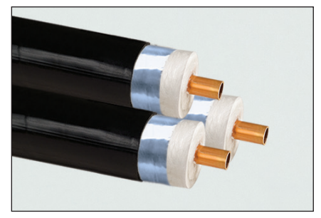
ThermoTube pre-insulated tubing used for steam supply and condensate return lines. Available in various materials and ratings. See Form TSP0009 for more info.

(Galvanized steel is standard for rigid channels—contact Thermon for optional stainless steel)