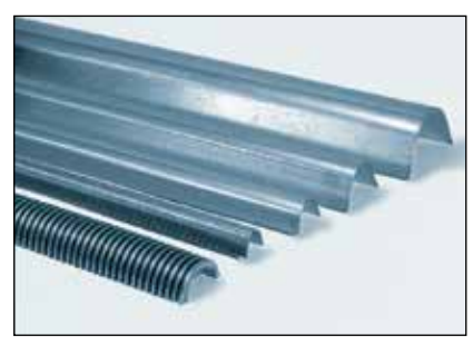
TFK Channels for ChannelTrace Systems