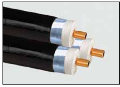
ThermoTube pre-insulated tubing used for steam supply and condensate return lines. Available in various materials and ratings.

(Galvanized steel is standard - contact Thermon for optional stainless steel)